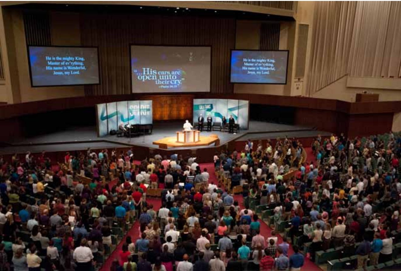
BJU students gather in FMA for Day of Prayer last September.

"It's a half day each semester that we get to corporately devote our time to the privilege of prayer," Wilcox said. "We get to draw near to the Lord together."