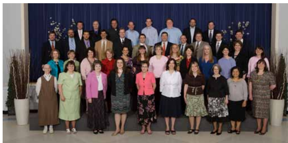
Members of the Class of 1990 celebrate their 20-year reunion in 2010.