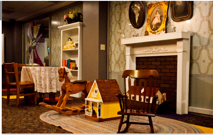
Visit M&G at Bob Jones University and at Heritage Green on the same day! Joint Admission: adults $8 / seniors $6 / students $4.50 Members are free with membership card.