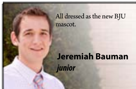
All dressed as the new BJU mascot.